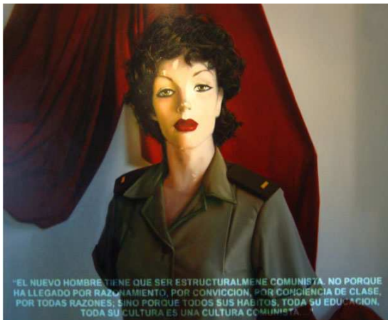
Rodolfo Peraza El evangelio según el hombre nuevo 2008 Oil and video-projection on canvas

The curator notes that as background of the exhibition has to be understood a political scenery in which “they make us part of the official history in which we can neither take over decisions nor express freely our ideas”. The artworks on show aim to reflect, question, criticise or, even, make fun of the actual situation. By means of video art, paintings, drawings or installations, each artist offers a reinterpretation of the collective experience from different points of views: Rodolfo Peraza offers an ironic and playful conducting, whereas Lázaro Saavedra adopts a critical attitude and Glenda León assumes a more intimate and private view on the theme.